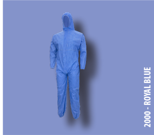
2000 - ROYAL BLUE